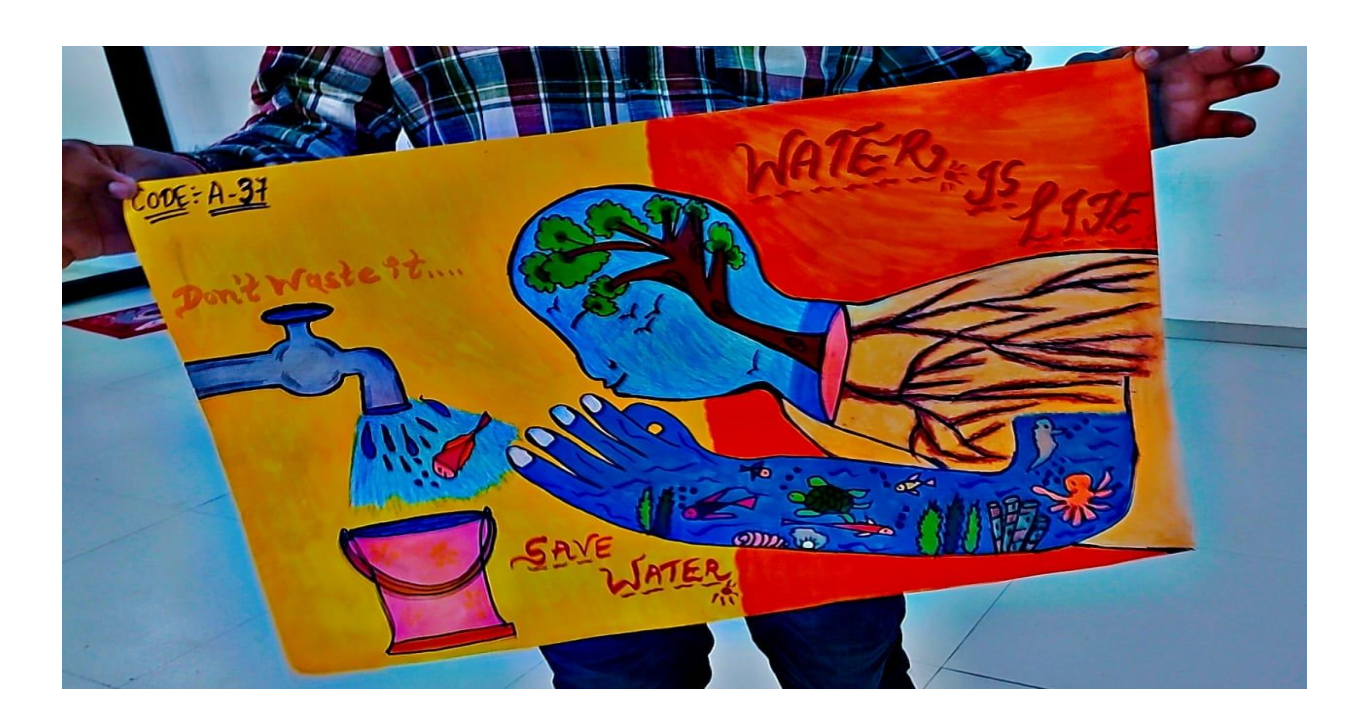
All Participants of Youth Festival Sep. 2024